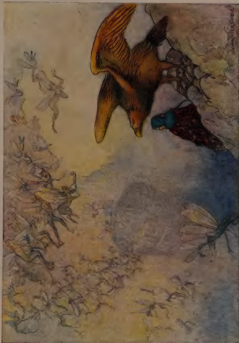
'THERE I COULD SEE WINGED WONDERS FLY.'